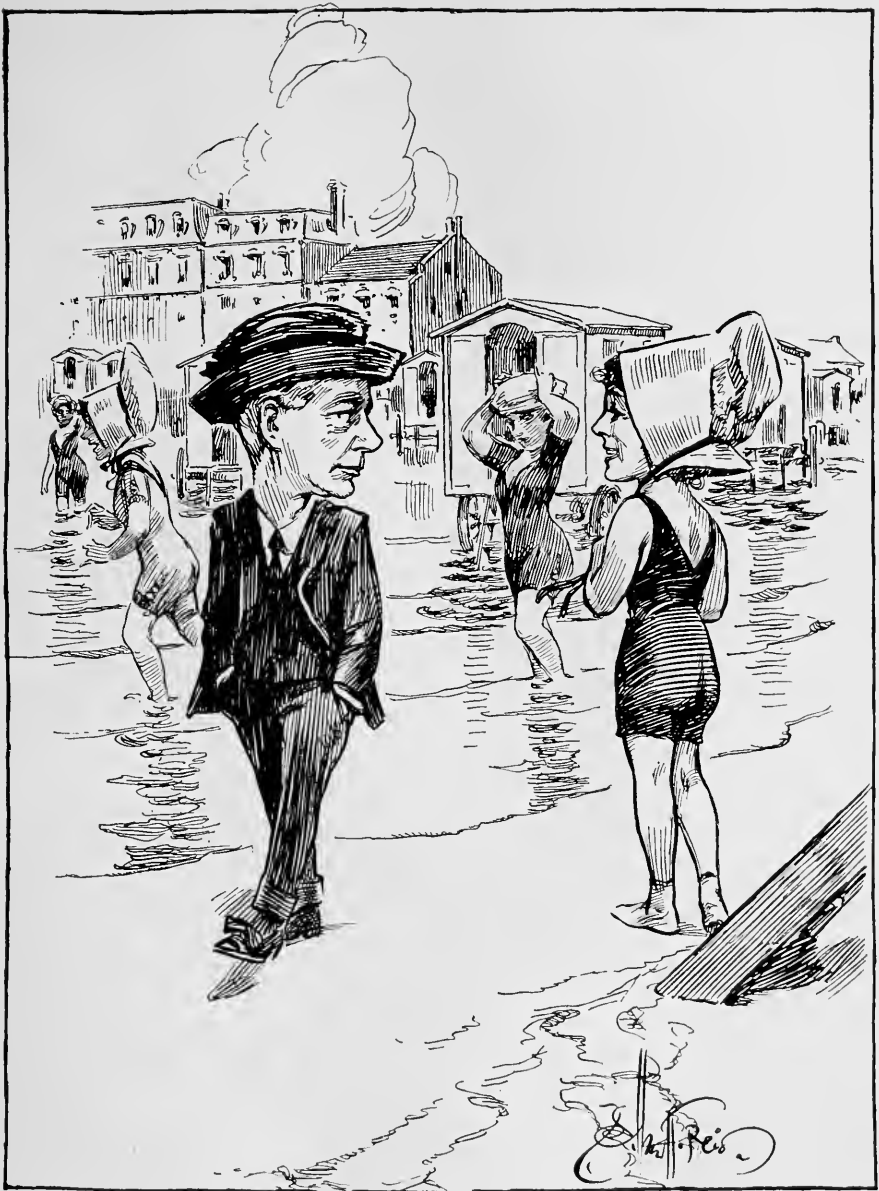
NO PLACE FOR A MAN FROM KANSAS